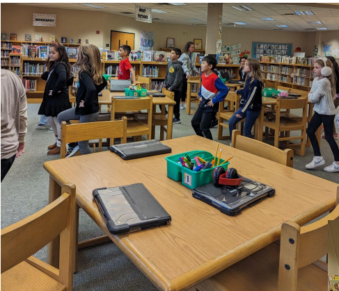
Learning the Jingle Dress Dance