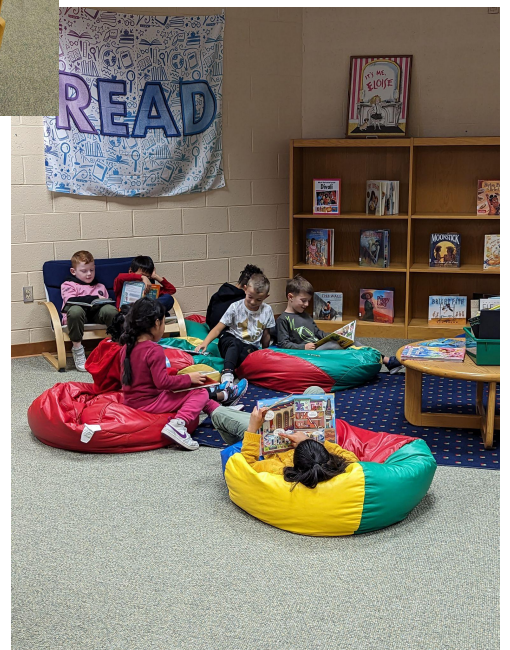
Reading in the book nook